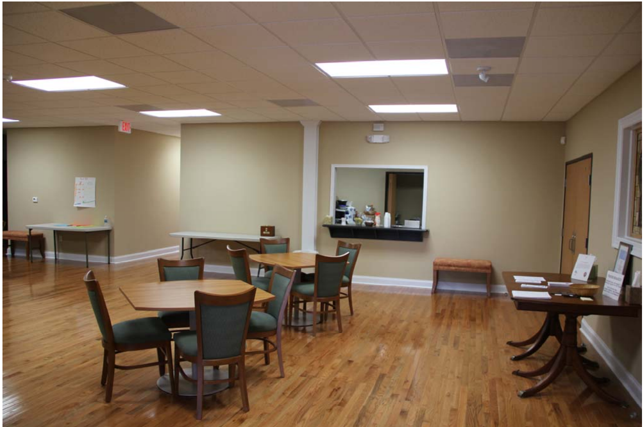
ABOVE: Walking from lobby into Fellowship Hall – Kitchen window for coffee.