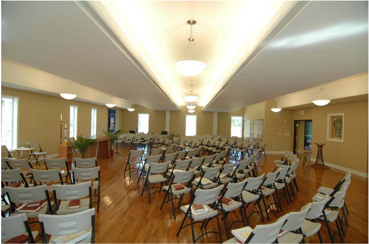
Shown above and below with chairs as normally arranged for weekly services. Ceilings are 11 feet high at the peak. Lighting and windows make this an absolutely beautiful space.