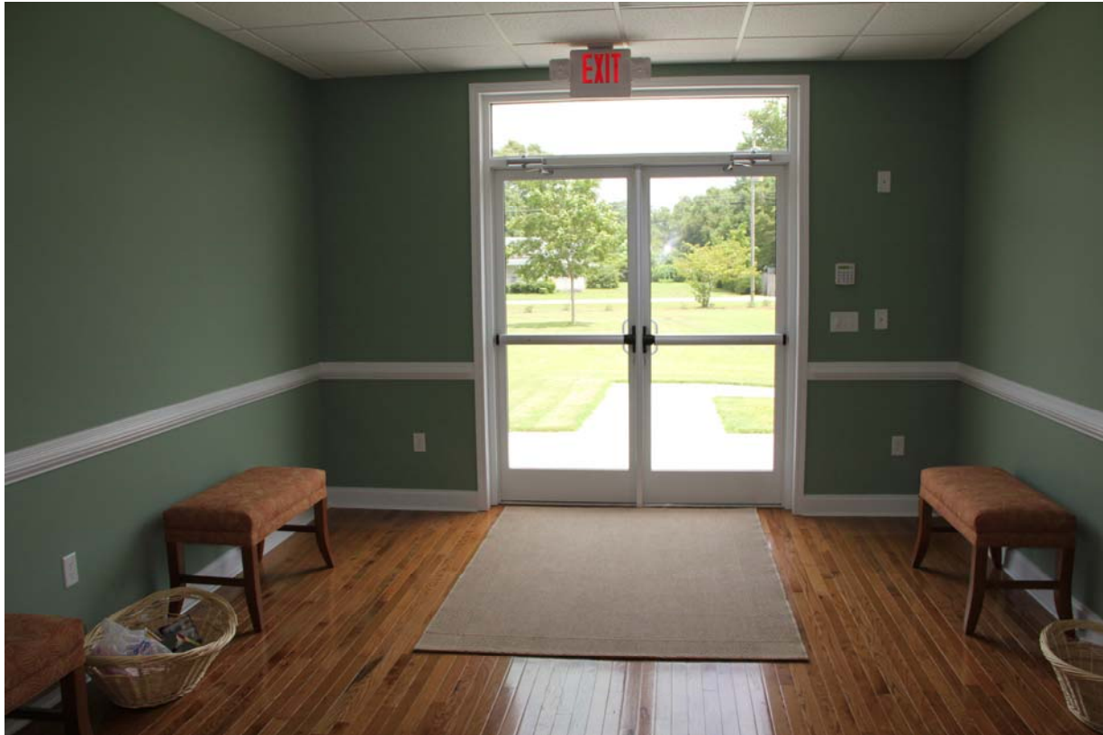
Lobby entrance gives a great "First Impression" to visitors. Makes a great greeting area before entering the Fellowship Hall which is the central informal gathering point which connects all rooms.