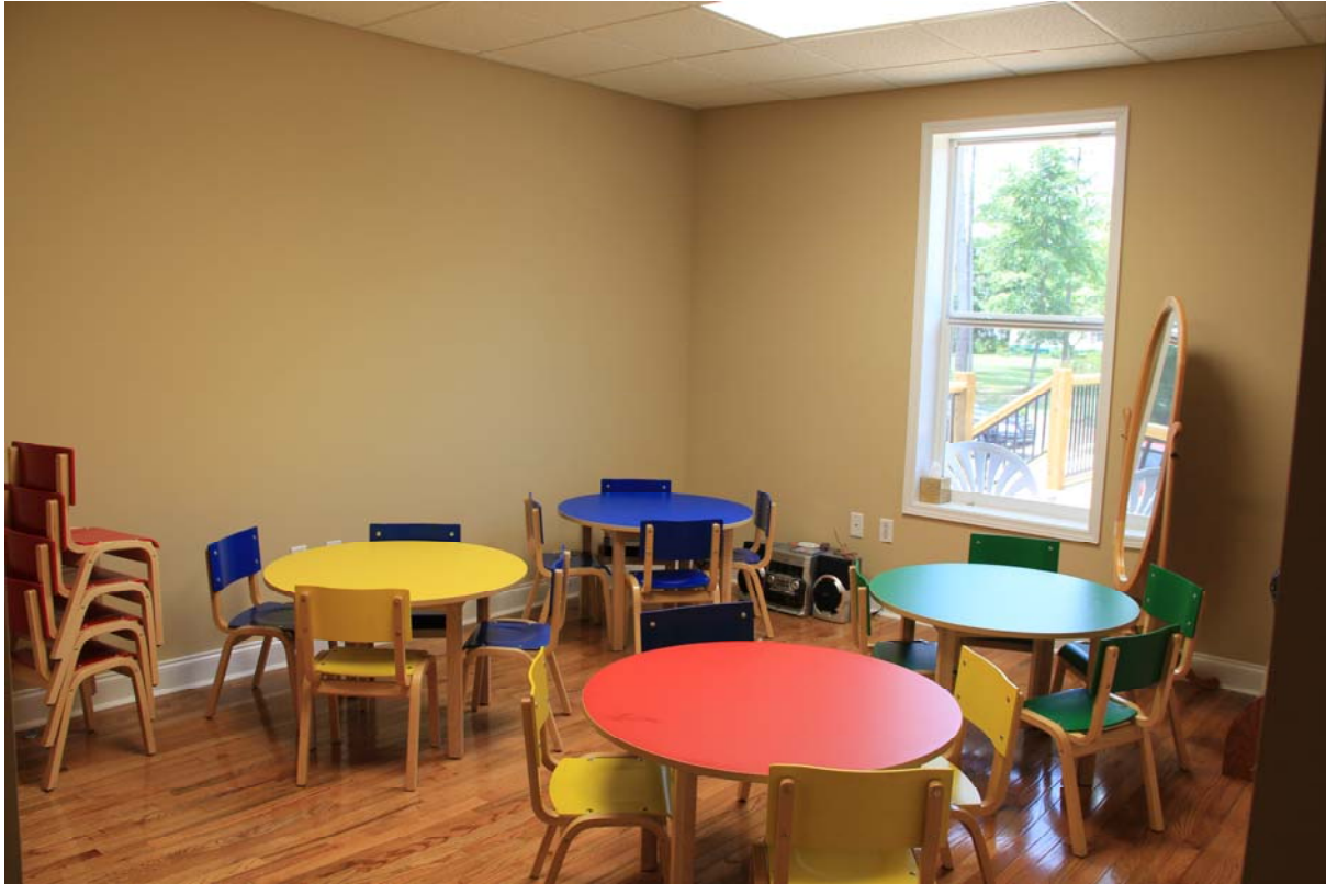
Kids classroom looks onto deck. Fellowship Hall connects all rooms and has a serving window into the large kitchen. Hall leads to back deck (below) Bathrooms are on either side of clock.