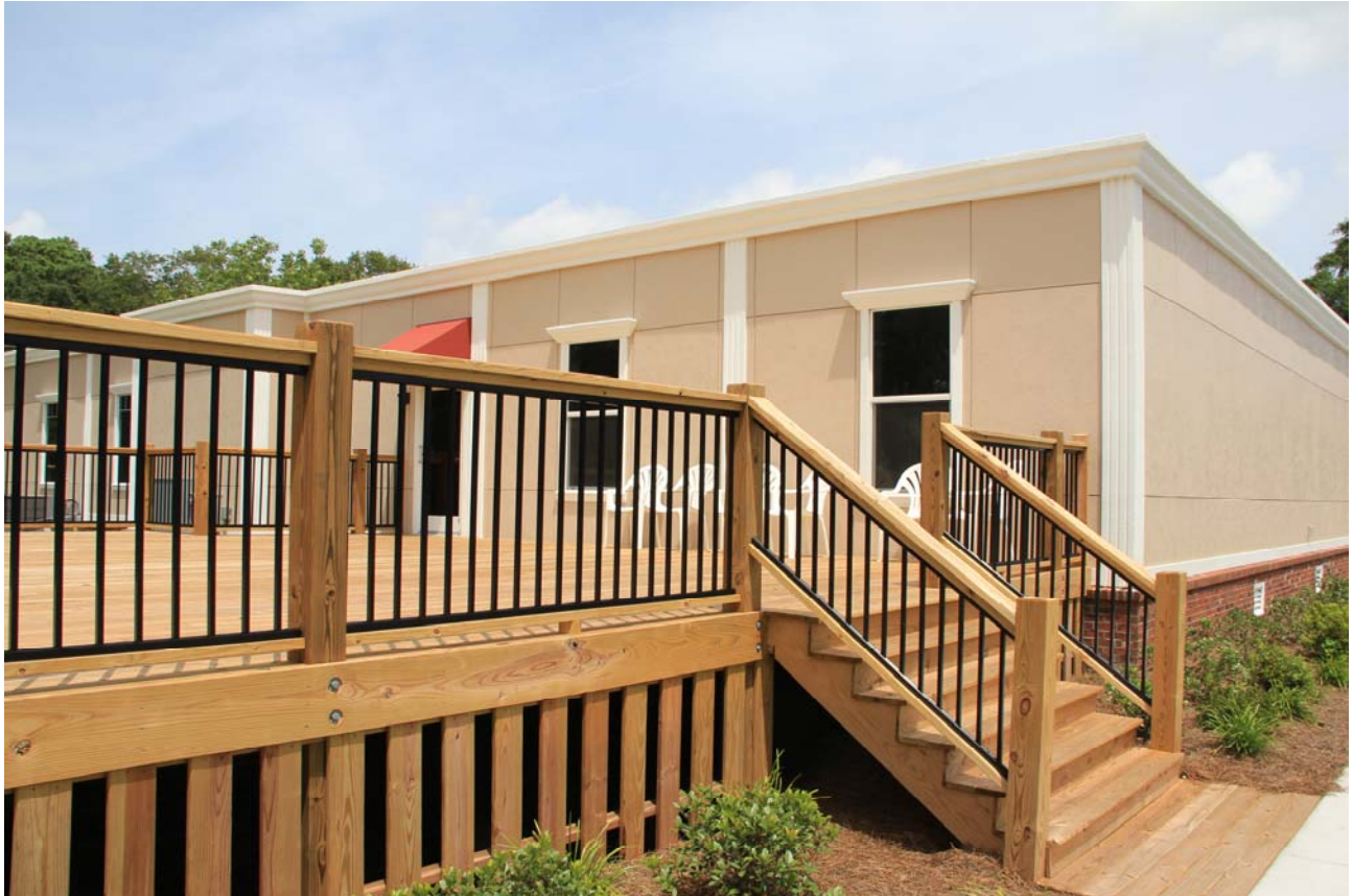
A huge deck extends the fellowship area for BBQs and outings.